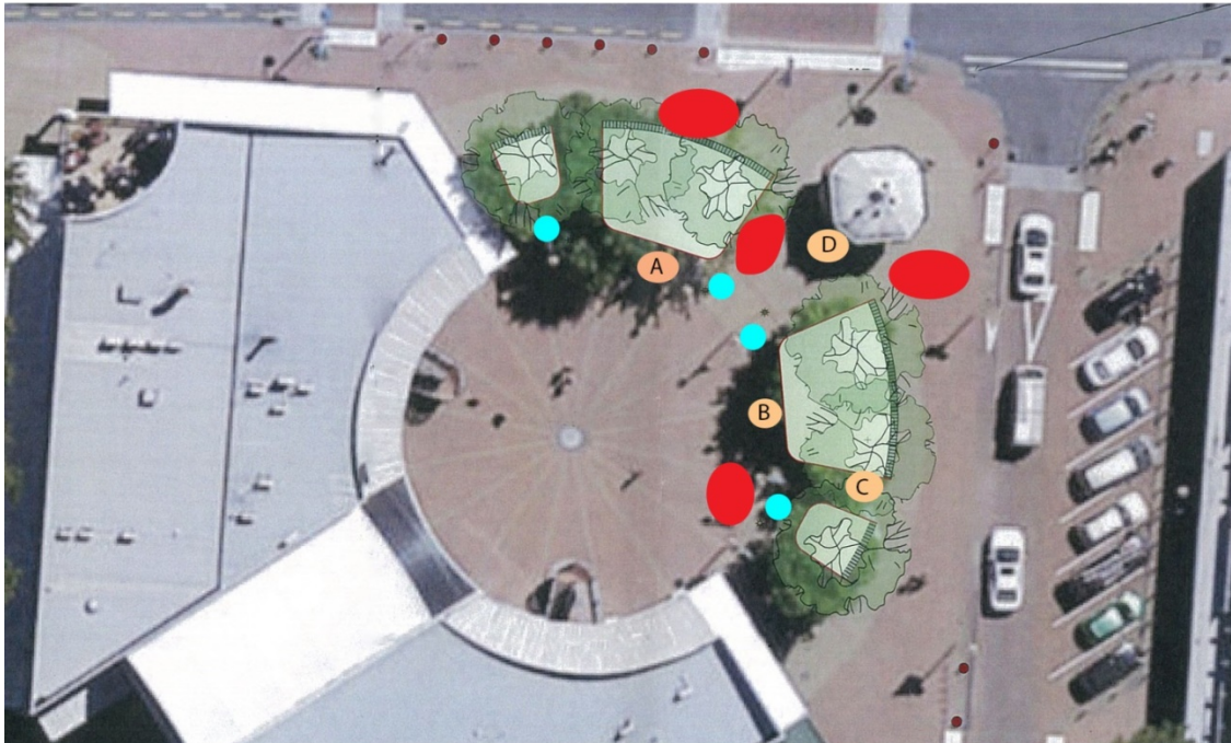
Market Place Aerial

A, B = Power outlet on lighting column D = 3 phase power C = Locked power outlet